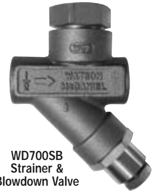
WD700SB Strainer & Blowdown Valve