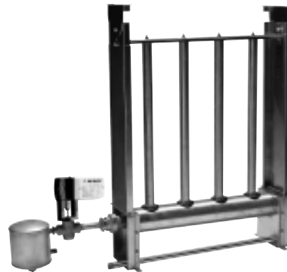
WSAM-e (Short Absorption Manifold) WLS Steam Humidifier mounted with a WSAM-e Manifold.